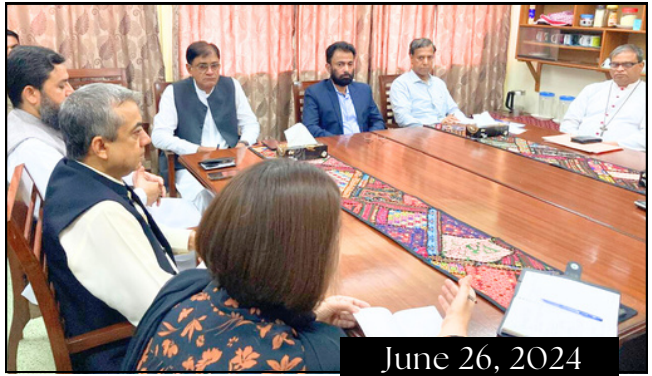
June 26, 2024