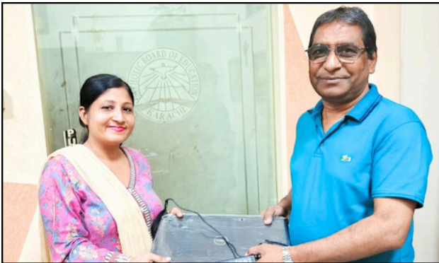
June 29, 2024

On June 26, 2024, a meeting was held between the Catholic Board of Education Karachi (CBE-K) and delegates from the Department of Empowerment of Persons with Disabilities (DEPD) and the Notre Dame Institute of Education (NDIE). The session aimed to address key issues and explore collaborative efforts to enhance educational opportunities and support for students with special needs. The discussion focused on the current challenges faced by students with special needs within the educational system and identifying strategies to create a more inclusive environment.