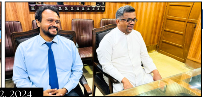
June 12, 2024